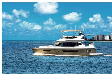
Marine / boats