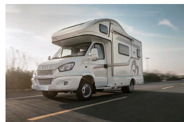
Motorhome / RV