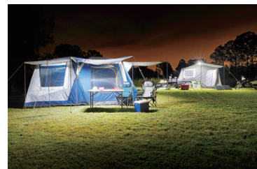
Back-up power / UPS